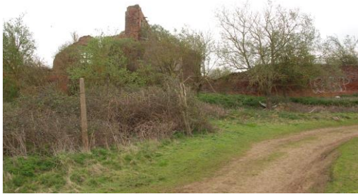
Brogborough Round House

SAVE BROGBOROUGH RINGWORK ANCIENT MONUMENT: The remains of a Medieval Castle at the Round House, Brogborough