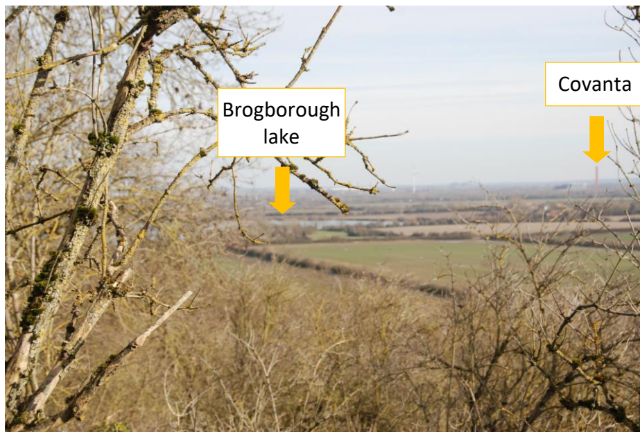
The view east along the Marston Vale from the site

The medieval castle (Ringwork) and Round House are both situated in this location on a spur of the Greensand Ridge to take advantage of the amazing views from this site in all directions, along the Marston Vale, and over towards Ridgmont in the opposite direction. Understanding the 'setting' of these historic monuments in this commanding defensive position is a key part of their historic context.