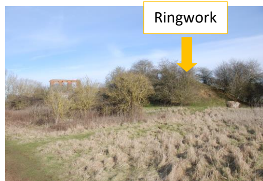
The Ringwork, medieval castle mound in the grounds of the Round House

Near Brogborough and Lidlington are the remains of a very rare medieval castle, (a medieval 'Ringwork'), one of only 200 remaining in the country. In the 12th century it was called Rugemont Castle and was the fortress of the de Greys and their predecessors the Wahulls who fought alongside Richard the Lionheart.